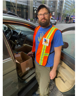
BSP volunteer ready to help save injured birds!