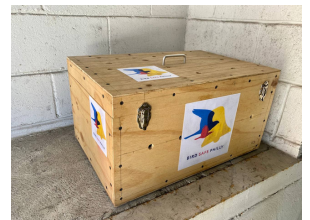
Bird Safe Philly injured bird holding box.